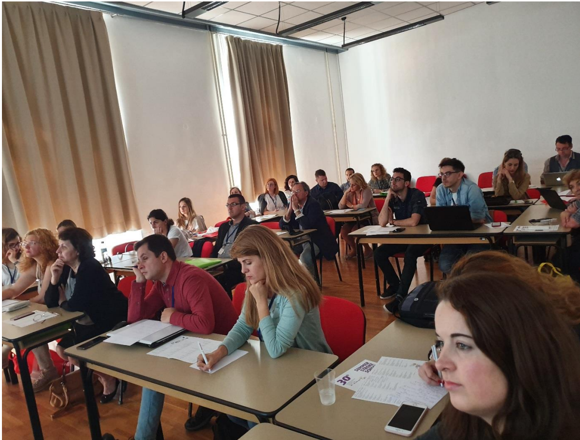
Picture 9. Participants of the 30 th Summer Stroke School in Dubrovnik