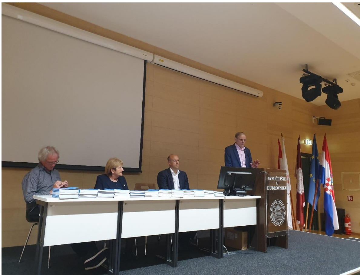
Picture 10. Promotion of the book on the occasion of the 30 th Anniversary of the Summer Stroke School