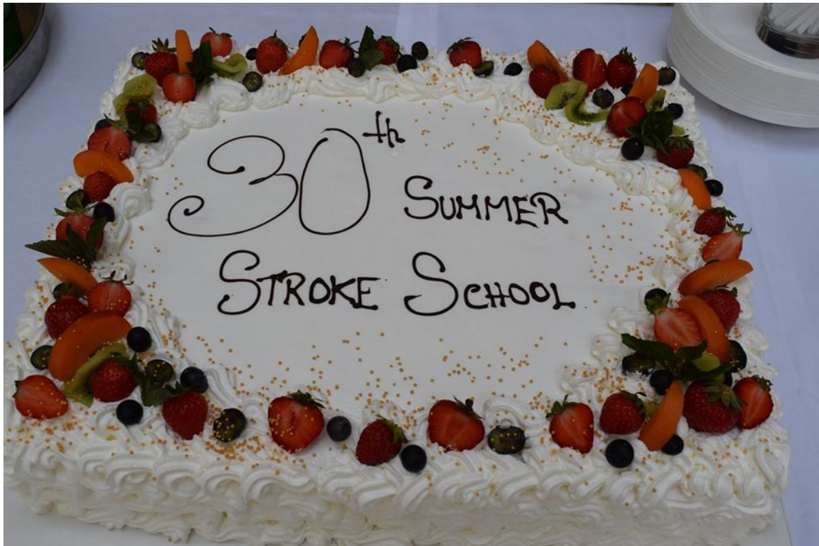
Picture 3. 30 th Anniversary of the Summer Stroke School in Dubrovnik, 2019