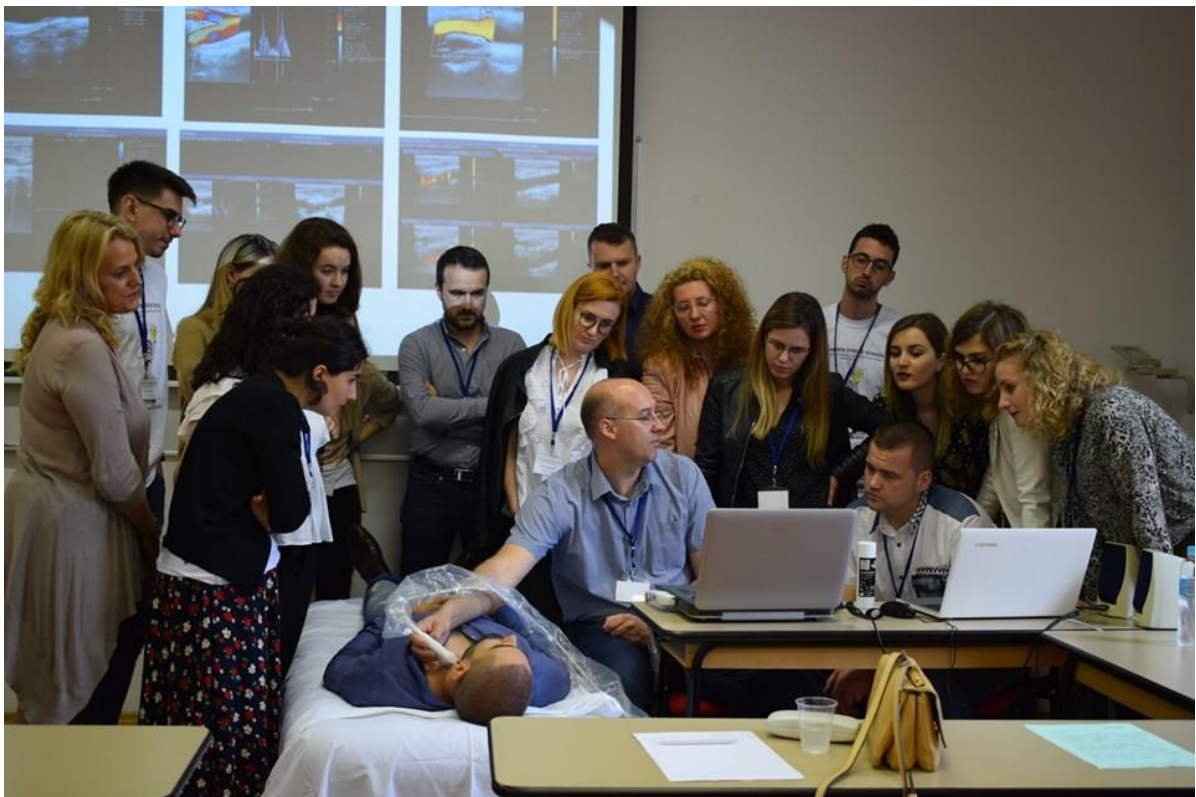
Picture 7. Ultrasound workshop at the 30 th Summer Stroke School in Dubrovnik, 2019